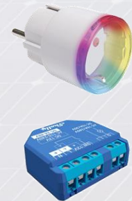
Direct control of Shelly Plus 1 & Plus Plug S